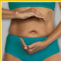
Ovarian Cancer Facts & Figures