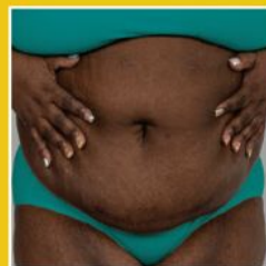
The Role Genetics Plays in Gynecologic Cancers