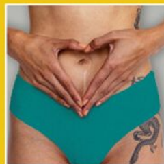
How to Advocate for Yourself as a Patient